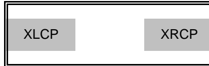
Right side monitor